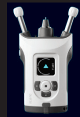
iCare HOME2 tonometer

With the iCare HOME2 tonometer, patients can take IOP measurements throughout the day, at night, and when lying down. Measurement results are uploaded to a cloud database where they are accessible to the doctor and patient for accurate real-world IOP data to support treatment decisions.